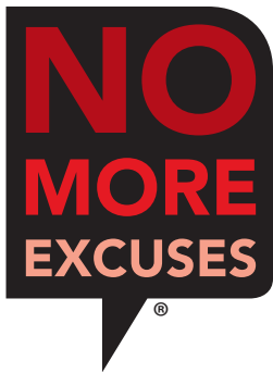
Founder of The Accountability Academy®, International Author and Accountability and Leadership Speaker